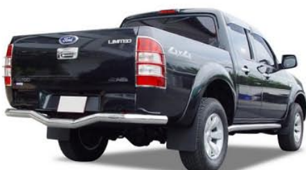
SUPER SPORT REAR BAR

Individually designed, Manufactured entirely from Stainless Steel (T304) Ø 3 inch or 76 mm. mirror Polished. No Drilling required. Ref.SS.WRB(Non-Tow).Ranger.MK.3