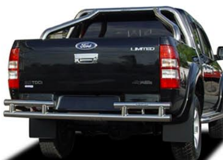
DOUBLE STRAIGHT REAR BAR

Manufactured entirely from Stainless Steel (T304) Ø 2.5 inch or 64 mm. Hand Polished. Ref. SS.RB.RANGER MK.3