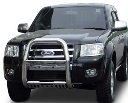
A BAR MK.1: Ø 3" or 76 mm.