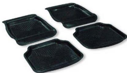
RUBBER MUD TRAYS (BLACK)