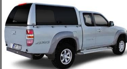
WORKSTYLE WITH SIDE WINDOWS