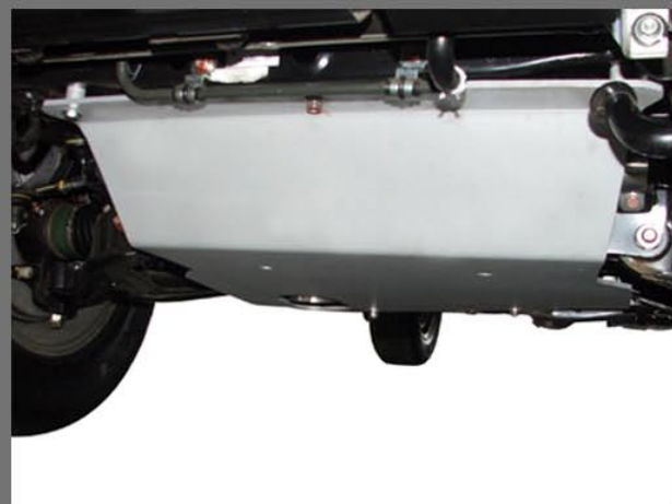
FUEL TANK PROTECTOR