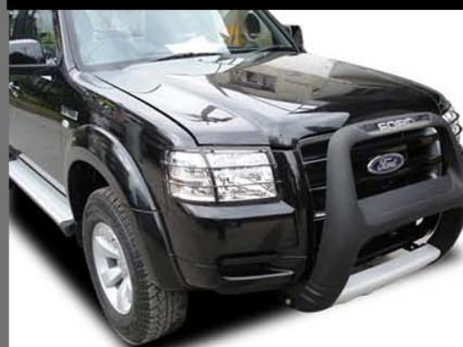
PU A BAR