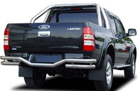
WRAPAROUND REAR BAR (NON-TOW)

Manufactured entirely from Stainless Steel (T304) Ø 2.5 inch or 64 mm. Hand Polished. Ref.SS.WRB(Non-Tow).Ranger MK.3