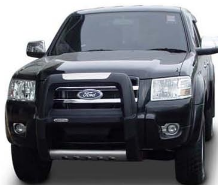
PLASTIC A BAR