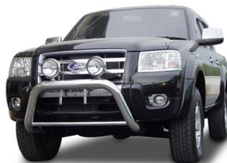
A BAR MK.5 Ø 3" or 76 mm.