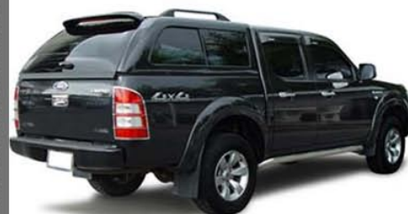
DOUBLE STRAIGHT REAR BAR