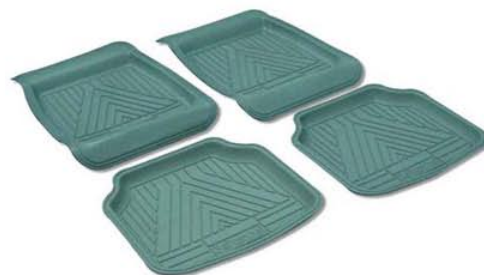
RUBBER MUD TRAYS ( GRAY )