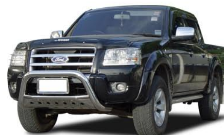
A BAR MK.4 Ø 3" or 76 mm.