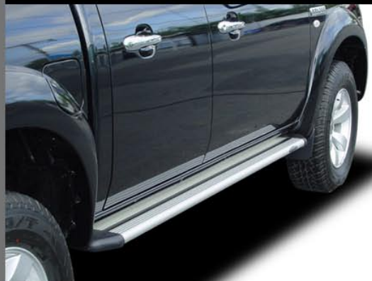
ALUMINUM RUNNING BOARDS-MK.2