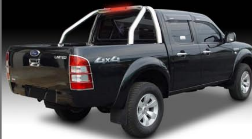
ROLL BAR SINGLE HOOP WITH BRAKE LIGHT