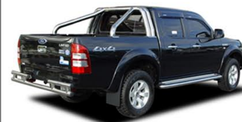
ROLL BAR DOUBLE HOOP