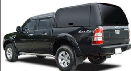
WORKSTYLE SOLID SIDE