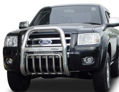
A BAR MK.2: Ø 3" or 76 mm.