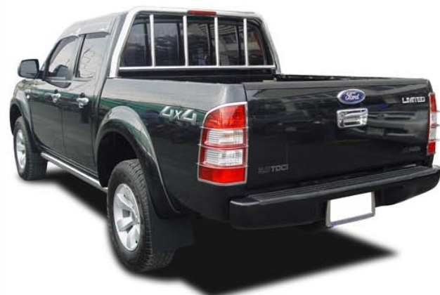
CABIN PROTECTOR/LADDER RACK