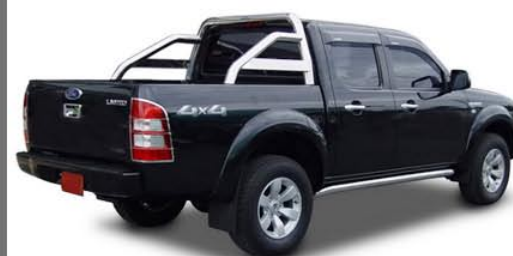
ROLL BAR SINGLE HOOP (KNOCK-DOWN)