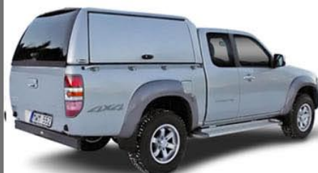
WORKSTYLE SOLID SIDE