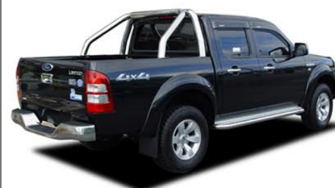
ROLL BAR SINGLE HOOP