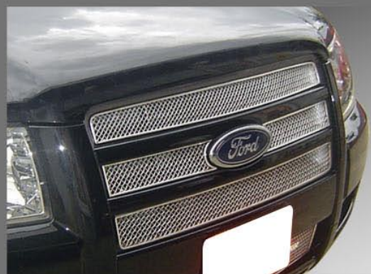
SPORT GRILLE MESH UPPER SET