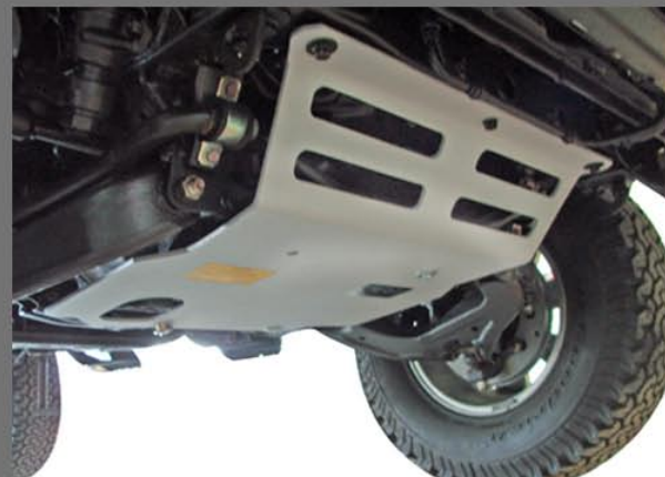
FRONT SKID PLATE