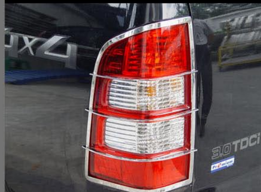
STAINLESS STEEL TAIL LIGHT GUARDS