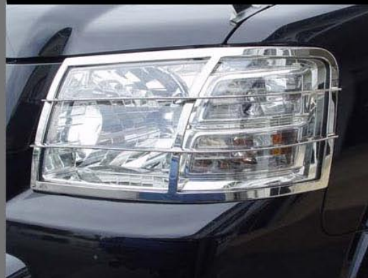
STAINLESS STEEL HEAD LIGHT GUARDS