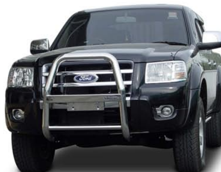
A BAR MK.3: Ø 2.5" or 64 mm.