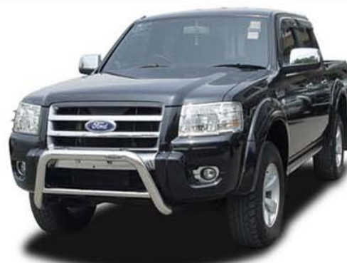
A BAR MK.4: Ø 2.5" or 64 mm.