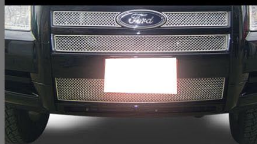
SPORT GRILLE MESH LOWER SET