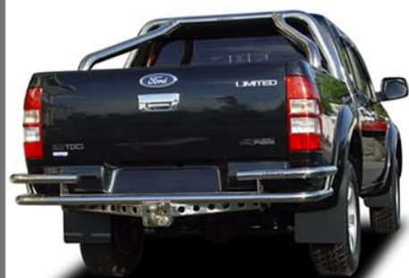
STEP TOW BAR Ø 2" or 50 mm.

Individually designed, manufactured entirely from Stainless Steel ( T304 ) Ø 2" or 50 mm. tubing, mirror polished. No Drilling required. Ref. SS.STB.RANGER MK.3