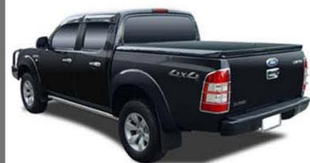
HARD TONNEAU COVER