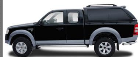
XRT EDITION EXTRA CAB