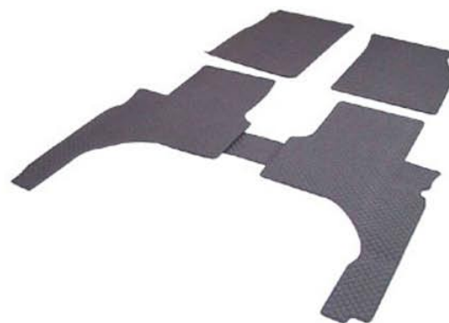
CUSTOM FIT FLOOR MATS