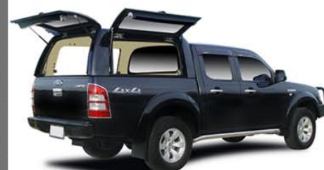
WORKSTYLE WITH SIDE WINDOWS