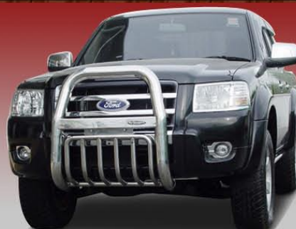
A BAR MK.2: Ø 3" or 76 mm.