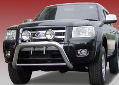
A BAR MK.4 Ø 3" or 76 mm.