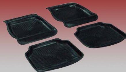
RUBBER MUD TRAYS ( BLACK )