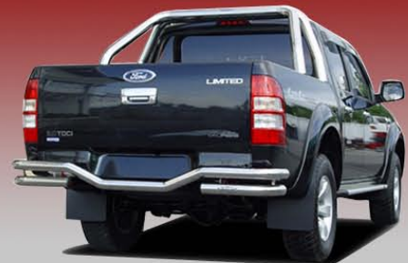
WRAPAROUND REAR BAR (NON-TOW)

Manufactured entirely from Stainless Steel (T304) ø 2.5 inch or 64 mm. Hand Polished. Ref. SS.WRB(Non-Tow).BT50