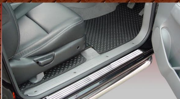
CUSTOM FIT FLOOR MATS