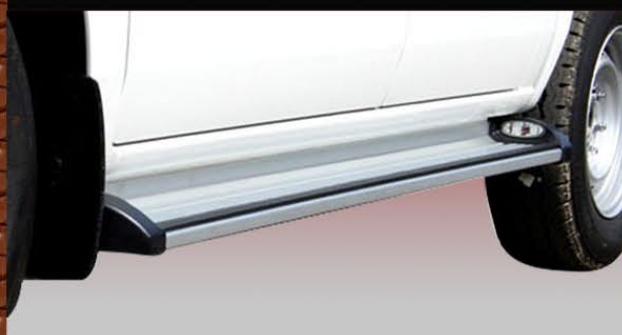
ALLOY RUNNING BOARDS with light