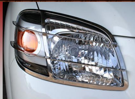
STAINLESS-STEEL HEAD LIGHT GUARDS