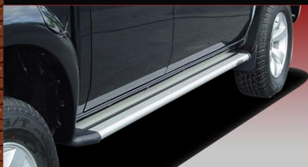
ALUMINUM RUNNING BOARDS-MK.1