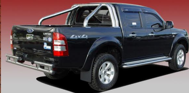
DOUBLE HOOP ROLL BAR

This Stylish and Sporty Roll Bar Double Hoop, Individually Designed, Manufactured Entirely From Premium and Durable Stainless Steel (T304) Ø 3" or 76 mm, Wall Thickness: 1.5 mm, is Hand Polished for an Exceptional Mirror Finish. Assembly kit for Easy Fitting. (Bed rail mounting and bed liner compatible) Ref. SS.ROB.DH.BT50