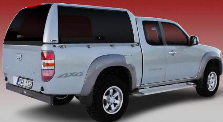
WORKSTYLE WITH SIDE WINDOWS