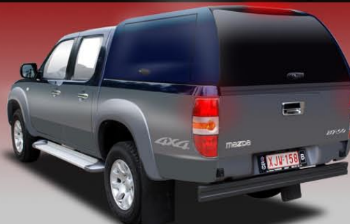
WORKSTYLE EDITION STANDARD