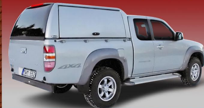
WORKSTYLE SOLID SIDE