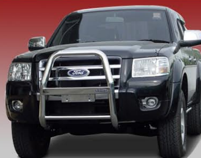
A BAR MK.3: Ø 2.5" or 64 mm.