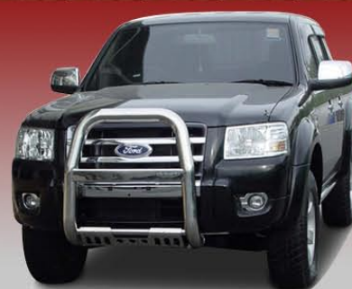
A BAR MK.1: Ø 3" or 76 mm.