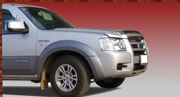
FENDER FLARES / WHEEL ARCHES