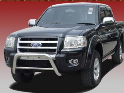
A BAR MK.4: Ø 3" or 64 mm.

Made from soft PU material, Pedestrian Friendly Front Bar Ref. PU.AB.BT50