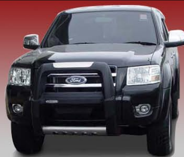
PLASTIC A BAR