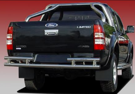
DOUBLE STRAIGHT REAR BAR

Manufactured entirely from Stainless Steel (T304) ø 2.5 inch or 64 mm. Hand Polished. Ref. SS.RB.BT50