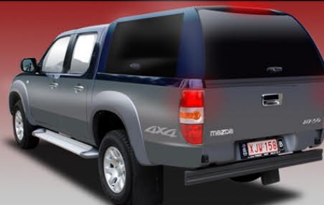
WORKSTYLE EDITION DELUXE