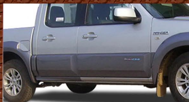
STAINLESS-STEEL TAIL LIGHT GUARDS