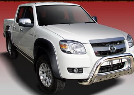
A BAR MK.6: Ø 3" or 76 mm.