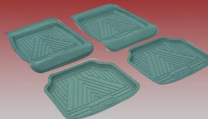
RUBBER MUD TRAYS ( GRAY )