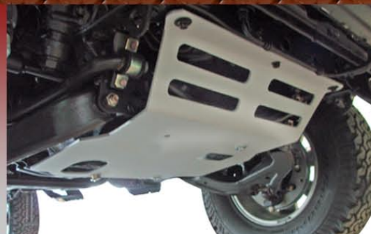
FRONT SKID PLATE

Manufactured entirely from premium and durable steel (4 mm), Silver Hardwearing Epoxy Powder Coated. Ref.S.SK.PL.BT50