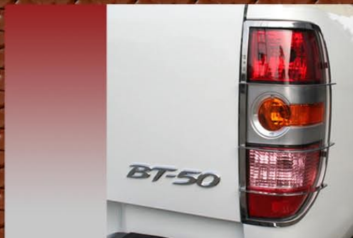
STAINLESS-STEEL TAIL LIGHT GUARDS