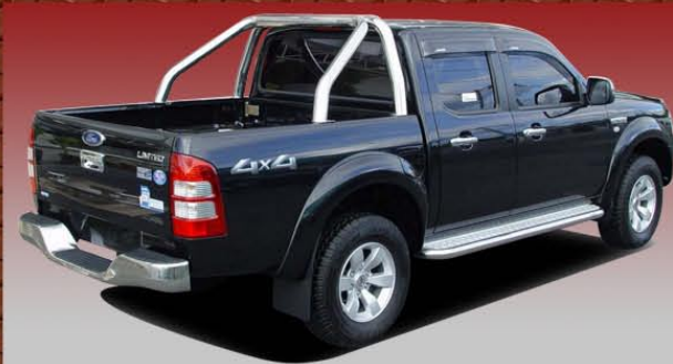
ROLL BAR SINGLE HOOP

This Stylish and Sporty Roll Bar Single Hoop, Individually Designed, Manufactured Entirely From Premium and Durable Stainless Steel (T304) Ø 3" or 76 mm, Wall thickness: 1.5 mm, is Hand Polished for an Exceptional Mirror Finish. Assembly Kit for Easy Fitting. (Bed rail mounting and bed liner compatible) Ref. SS.ROB.SH.BT50