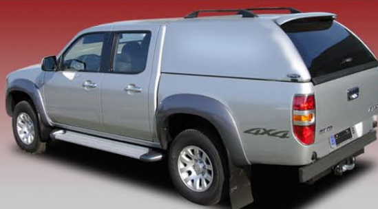
XTC COMMERCIAL EDITION