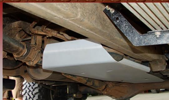
FUEL TANK PROTECTOR

Manufactured entirely from premium and durable steel (4 mm), Silver Hardwearing Epoxy Powder Coated. Ref.S.FTP.BT50