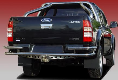
STEP TOW BAR ø 2" or 50 mm.

Individually designed, manufactured entirely from Stainless Steel ( T304 ) ø 2" or 50 mm. tubing, mirror polished. No Drilling required. Ref. SS.STB.BT50